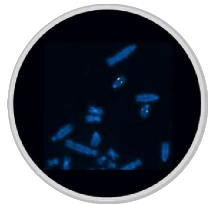
Figure 2: Pinpoint FISH™ small-target (~10kb) transgene probe in a metaphase cell.