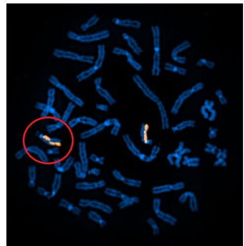
Above: Inversion / sister chromatid exchange in chromosome 13 detected by dGH SCREEN™ in a GM cell line.